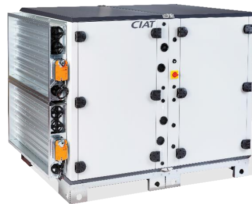
Top left: CIAT Vectios Top right: CLIMACIAT Airtech Bottom left: CIAT Comfort Line Bottom right: CIAT Floway